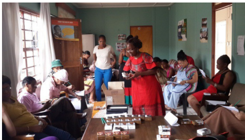
CTCA & University of Pretoria South Africa supporting development of Pictorial Health Warnings