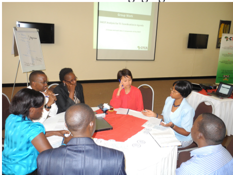
CTCA in Uganda supporting Tobacco Control Country Coordination