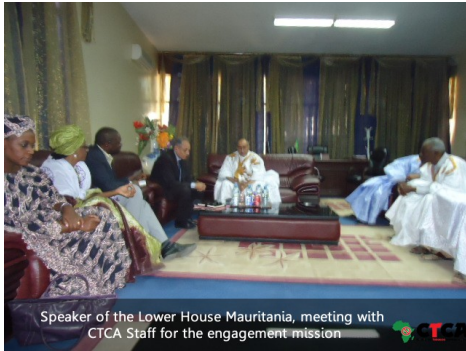
CTCA in Mauritania engaging Government on Tobacco Control Bill