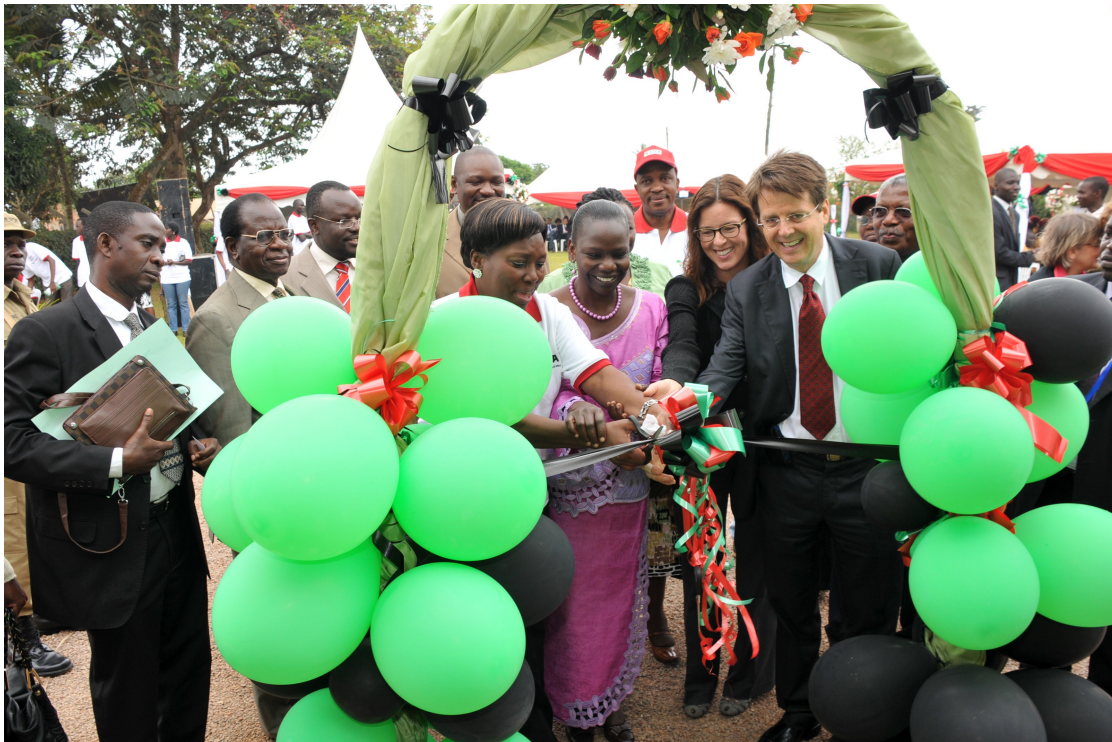
CTCA being launched by Speaker, Minister for Health, WHO TFI & Bill and Melinda Gates Foundation Representative in Kampala, Uganda.

CTCA is a ‘go-to’ resource Centre for Tobacco Control in Africa and was launched in November 2011, with the overall mandate of supporting African Governments to advance tobacco control policies and legislation. This is done through the provision of technical support, materials and tools kits, creating a platform for dialogue, experience sharing, and innovation in tobacco control in six target countries including Angola, Gambia, Kenya, Mauritania, South Africa and Uganda.