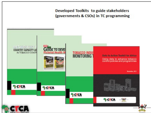
Tobacco Control Tool kits developed